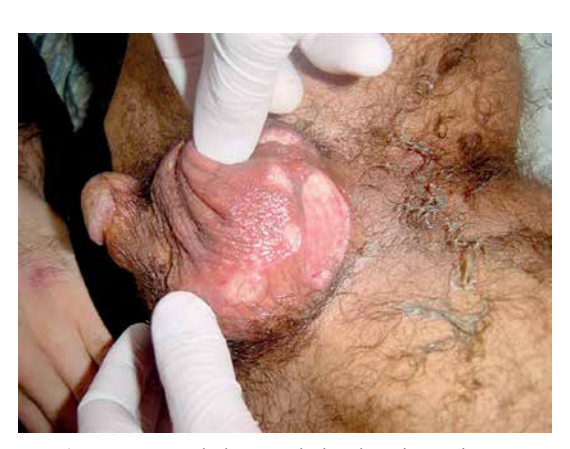
Figure 2. Genital ulcers with deeply indurated margins

Skin manifestations are regarded as major manifestations of the disease. Most often papu-