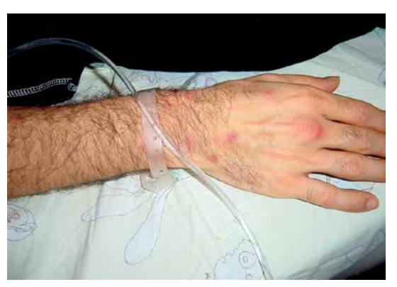
Figure 6. A positive pathergy test which manifests within 48 h as an erythematous papule at the site of a skin needle prick