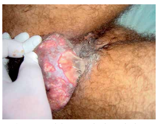
Figure 3. Genital ulcers covered with grayish-white fibrinous exudate