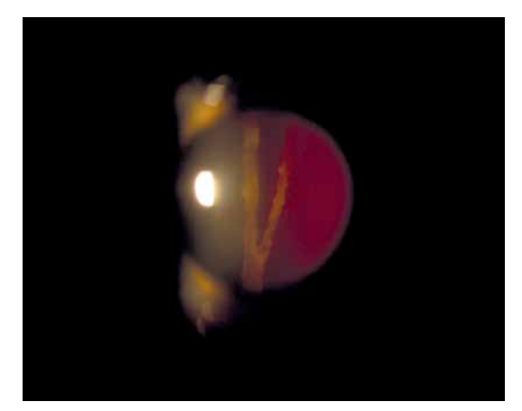
Figure 4. Band exudates within the base of the vitreous body

A positive pathergy test is regarded as the only currently existing diagnostic test for BD. It is an important component of many of the 16 sets of classification criteria used to diagnose BD [23]. Pathergy is a cutaneous phenomenon which can be observed not only in BD but also in pyoderma gangrenosum, so a positive pathergy test is not of course synonymous with DB. In this condition a minor trauma such as an injection or surgical incisions leads to the development of skin lesions or ulcers that may be resistant to healing. Physicians looking toward a diagnosis of BD may attempt to induce a pathergy reaction with a test known as a "skin prick test", in which they prick the skin with a small needle. After 1 to 2 days in many patients with BD a red bump may develop (Figure 6). The pathergy reaction is a unique feature of BD and, according to the ISG and also ICBD, is among the major criteria required for the diagnosis. A positive pathergy test helps to confirm the BD diagnosis, but lack of reaction does not exclude it. Presence of a positive pathergy reaction is not